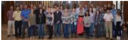
Univ Kentucky - Lexington