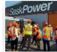
Knowledge Ctr - Regina