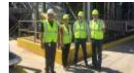
TCM - Mongstad