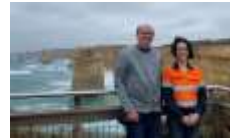
CO2CRC - Melbourne