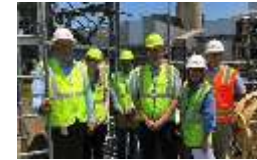
CSIRO - Brisbane