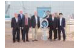
ITC Test Ctr - Gillette