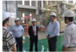
KEIR - Dajeon