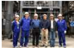
Nice - Beijing