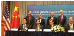
CCUSRP - Guangdong