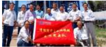
CERI - Beijing