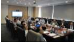
ITCN Mtg Beijing