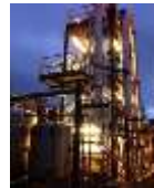
UKCCSRC - Sheffield